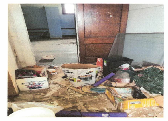
Rhino's Building 2<sup>nd</sup> Floor